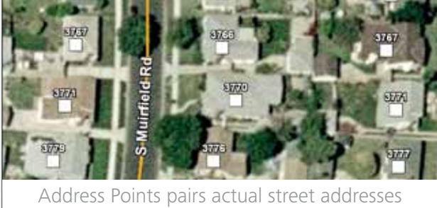
Address Points pairs actual street addresses to physical buildings

High Quality Digital Maps - provide the richest, freshest and most accurate global road network database. They integrate turn by-turn directions, road data including signage and intersections to get your business moving quickly and efficiently.