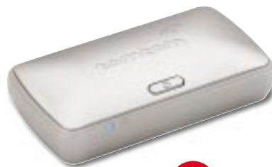
Wireless GPS receiver